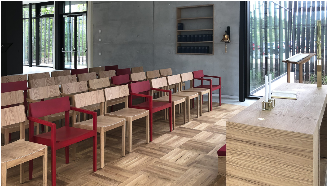
Herlev Hospital, Denmark.