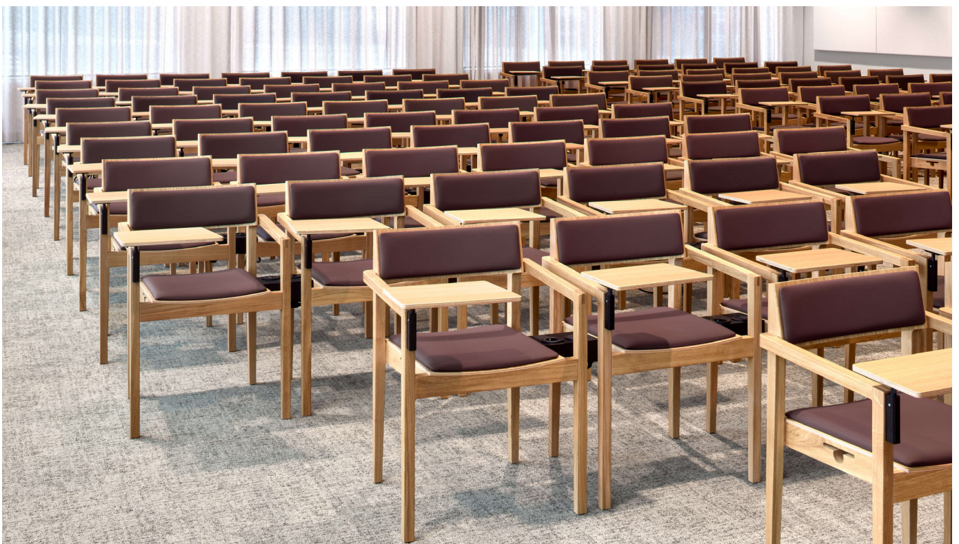
Skatteverket, Stockholm.