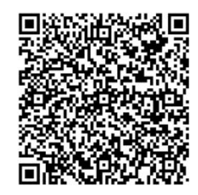
AR- QR code

Height: 765mm Seat height: 460mm Width: 530mm Depth: 515mm